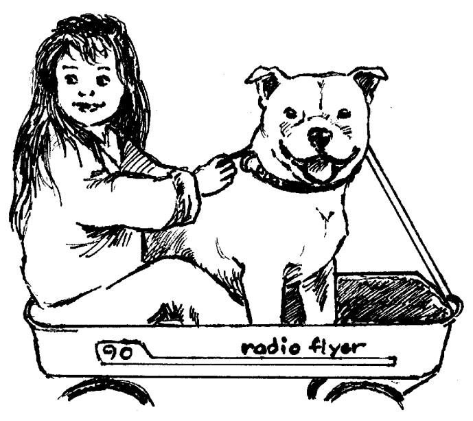
In England, the Stafford is known as the "Nanny Dog"

The first Staffordshire Bull Terriers brought to the United States lived their lives out simply as companions; it was not until 1975 that the AKC elevated the Stafford to the status of a breed that could be shown outside of the Miscellaneous Classes. The first Stafford to be registered in the AKC Stud